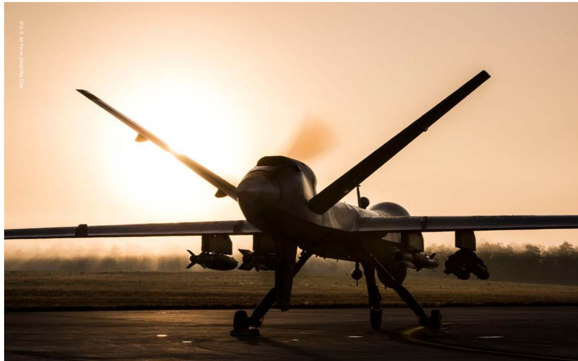
An MQ-9 Reaper sits on the flight line as remotely piloted aircraft crews wait for the fog to clear during Combat Hammer Nov. 6, 2017 at Duke Field, Fla.

The use of armed drones in compliance with international law is also a recurring theme within the UN General Assembly's First Committee. Countries such as the Netherlands, Lebanon, and Botswana emphasized the importance of regulating the use of armed drones in a universal and inclusive manner 'based on the principles of Human Rights and International Humanitarian Law'. 36 Though paramount, the focus on the principles of international law has frequently resulted in a legal debate; often abstract and far removed from the reality in which victims live. For this reason, the following chapters will translate the principles of law to the realities on the ground by discussing both international law and a number of matching case studies. 37