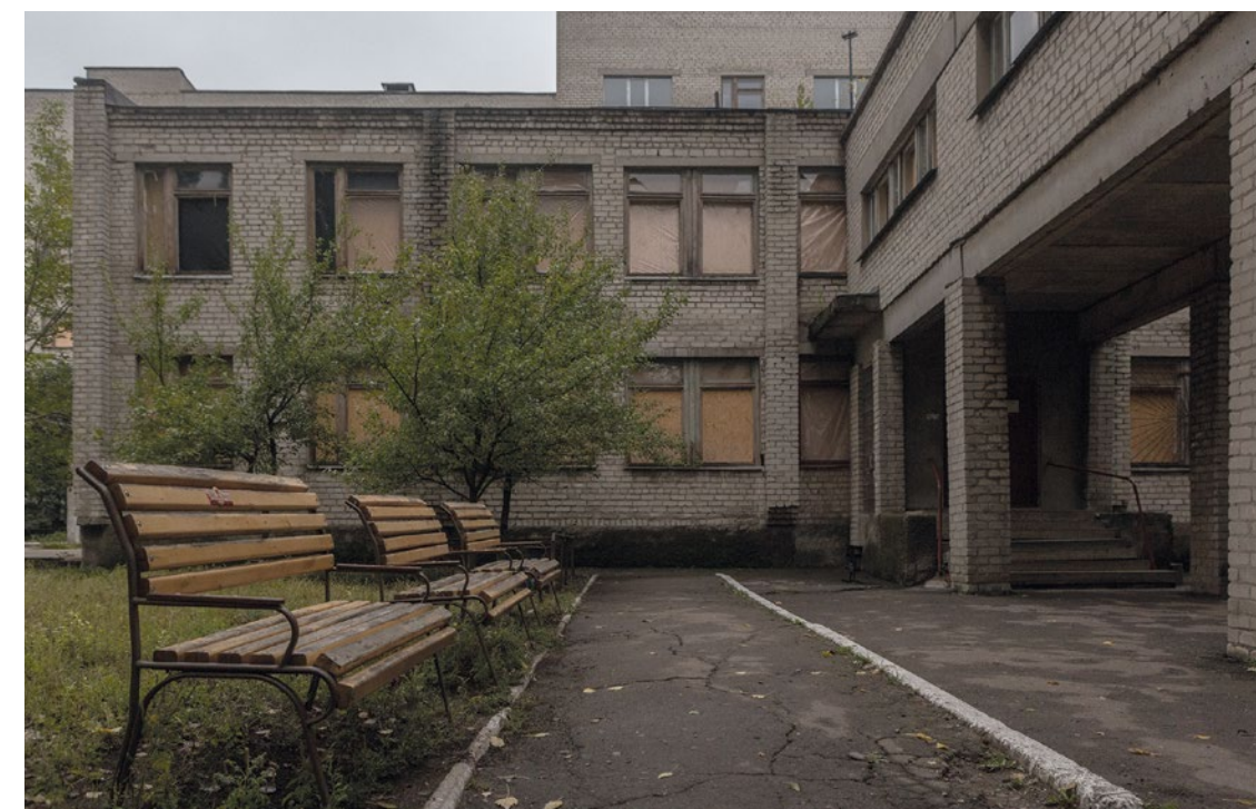
Empty benches stand outside a wing of Avdiivka City Hospital that was abandoned after two direct hits by explosive weapons. © Anton Skyba for International Human Rights Clinic at Harvard Law School and PAX / September 2016.

Ukraine's health care system, which already fell below the standards of other parts of Europe, has suffered as a result of the conflict. For example, the contact line has made it difficult for civilians on the government controlled side to access the region's specialized hospitals located in or near Donetsk in the non-government controlled areas. Military checkpoints have prevented medical personnel from reaching their patients and patients from reaching nearby hospitals and clinics. Ambulances have reportedly come under small arms fire. Most relevant for this report, shelling has interfered with the provision of health care in a number of ways.