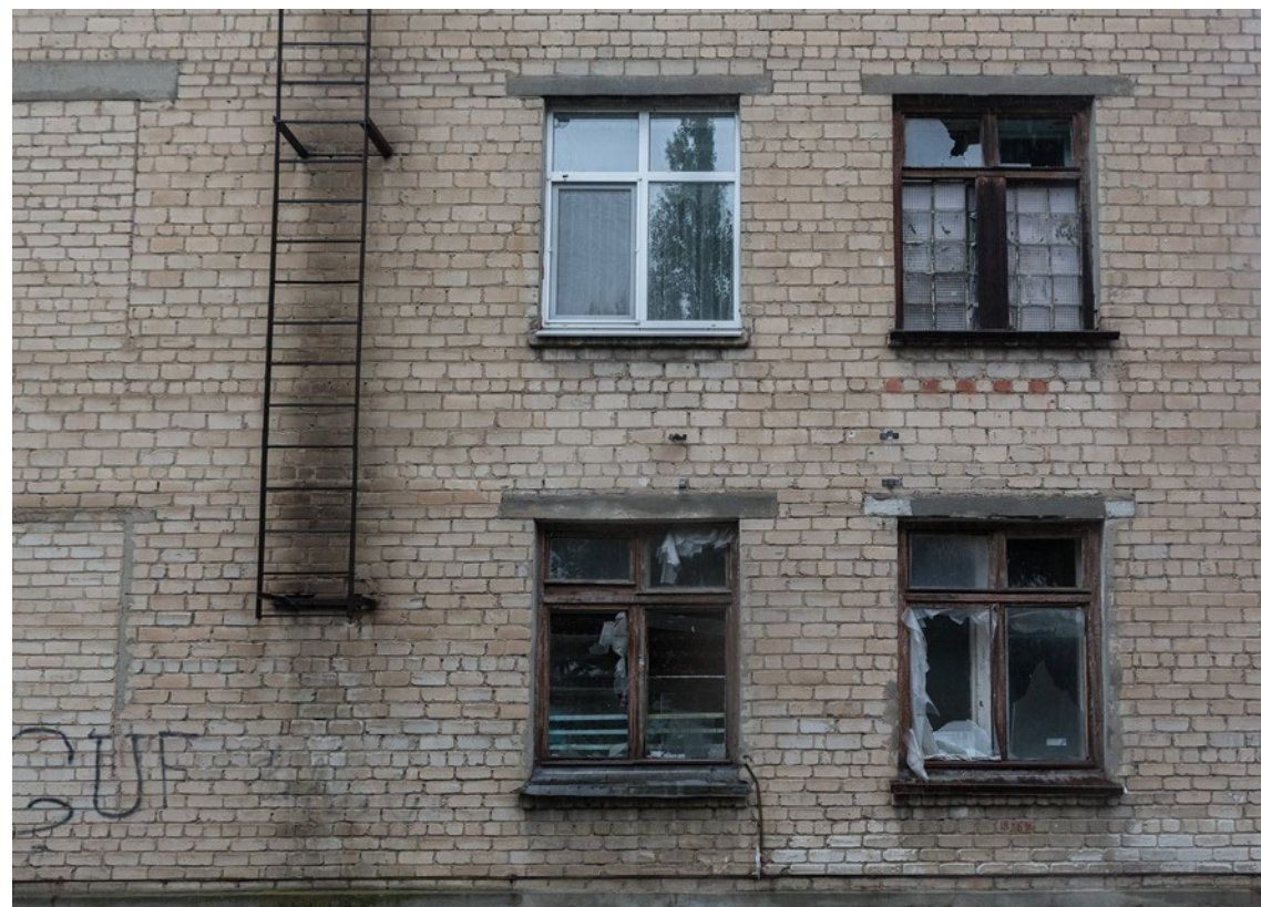
Explosive weapons shattered windows at Maryinka District Central Hospital in Krasnohorivka. While some windows had been replaced by September 2016, others consisted of broken glass and torn plastic sheeting. © Anton Skyba for International Human Rights Clinic at Harvard Law School and PAX / September 2016.

Shelling has also caused indirect harm by making travel dangerous for medical personnel. While many health workers have risked their lives to reach the hospitals and clinics where they care for patients, shelling has at times made their journeys impossible. Some medical personnel have even felt compelled to leave the region altogether in order to protect themselves and their families. During periods of heavy shelling, the use of explosive weapons has prevented ambulance personnel from leaving their stations and providing emergency services to residents in need.