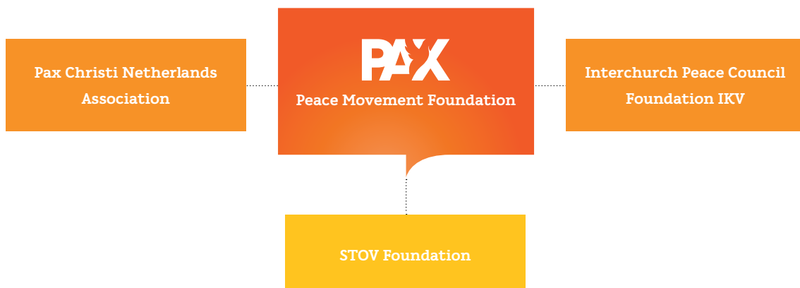
DIAGRAM OF LEGAL STRUCTURE AS AT 1 JANUARY 2023