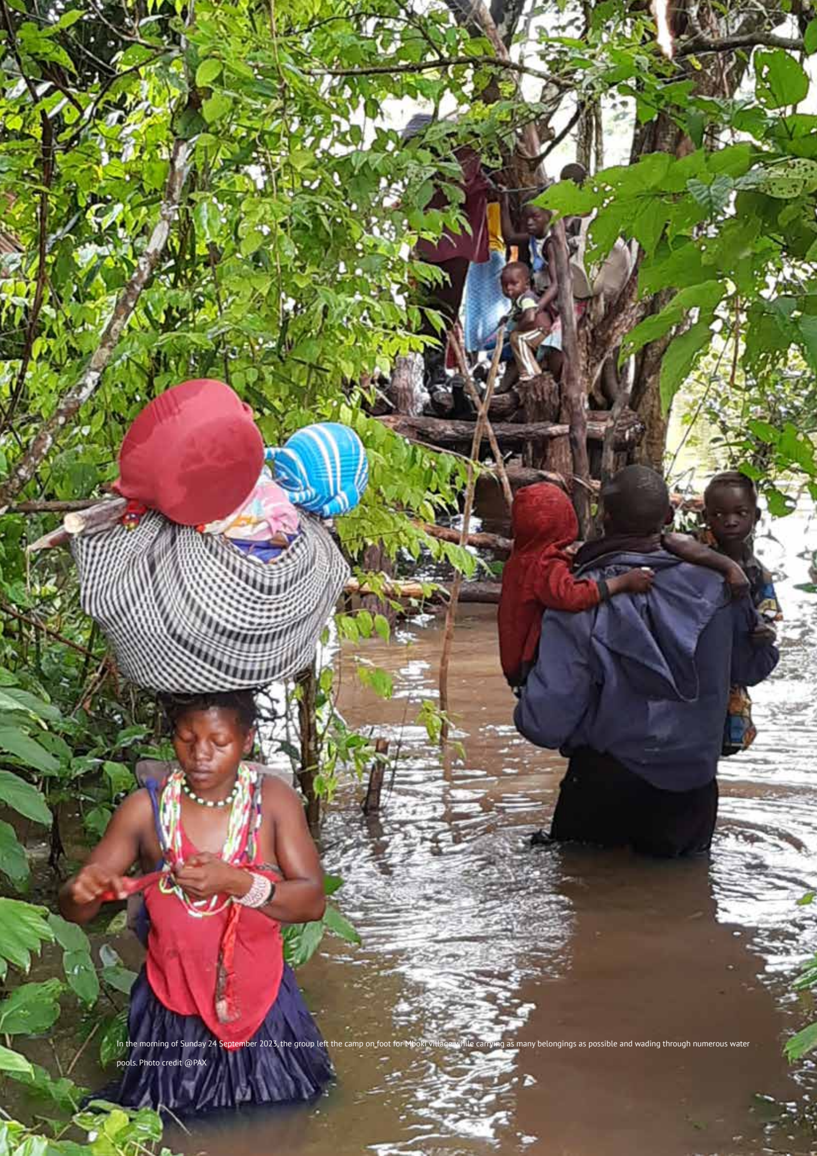
In the morning of Sunday 24 September 2023, the group left the camp on foot for Mboki village while carrying as many belongings as possible and wading through numerous water pools.