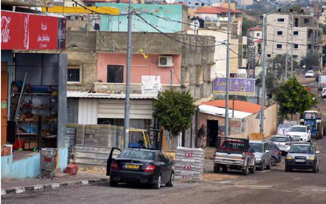
Palestinian town on the Westbank