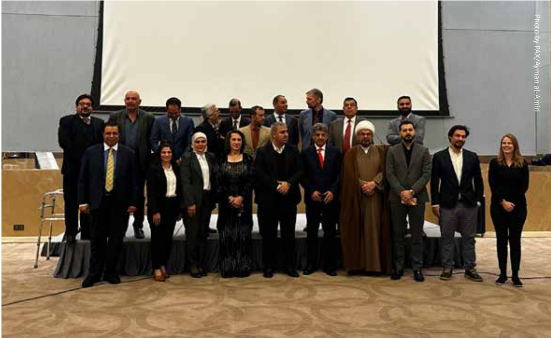
Participants of the December 2023 PoC Policy Workshop in Sulaymaniyah, Iraq.