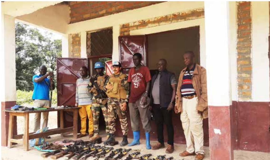
Disarmament of the Lord's Resistance Army (LRA) rebel group in the Central African Republic (CAR).

This case highlights the importance of sustained commitment and collaborative partnerships in addressing complex humanitarian challenges. It shows what can be achieved when organizations, governments, and communities come together with a shared goal of peace and reconciliation.