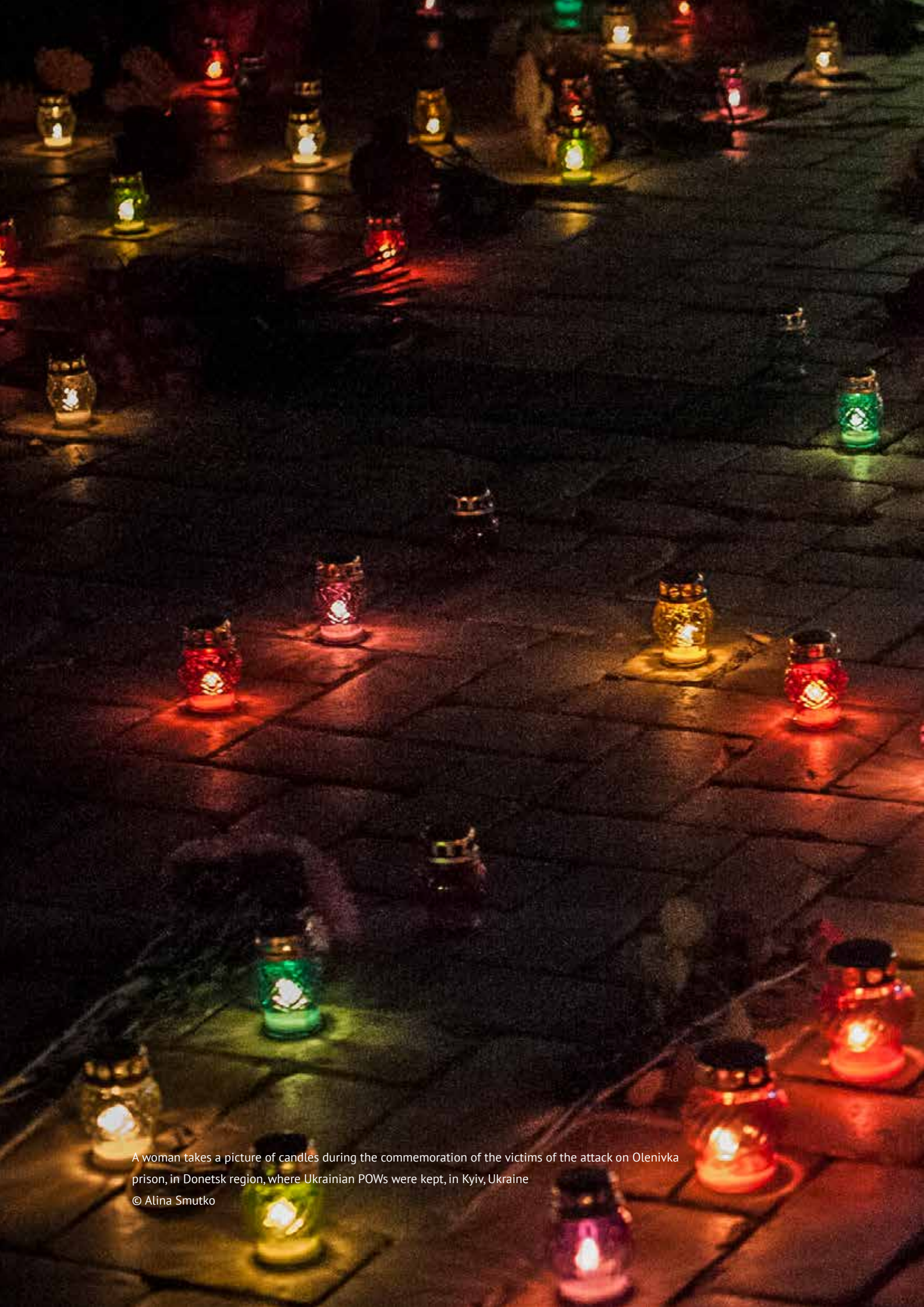
A woman takes a picture of candles during the commemoration of the victims of the attack on Olenivka prison, in Donetsk region, where Ukrainian POWs were kept, in Kyiv, Ukraine