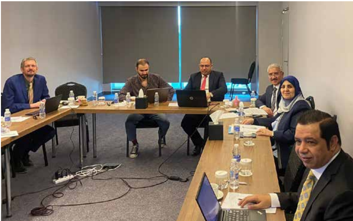
February 2024 Final PoC Policy core group session in Erbil, Iraq

The Iraqi context continues to face different types of security challenges, prompting the Iraqi government to decide on a PoC policy not just for times of conflict, which is usually the case, but for peace time as well. The draft policy is applicable to all security and defence actors, including law enforcement. The long-term engagement of PAX in Iraq, also with regards to its other peace work, has made PAX a trusted organisation and played an important role in enabling this combination of bottom up and top down.