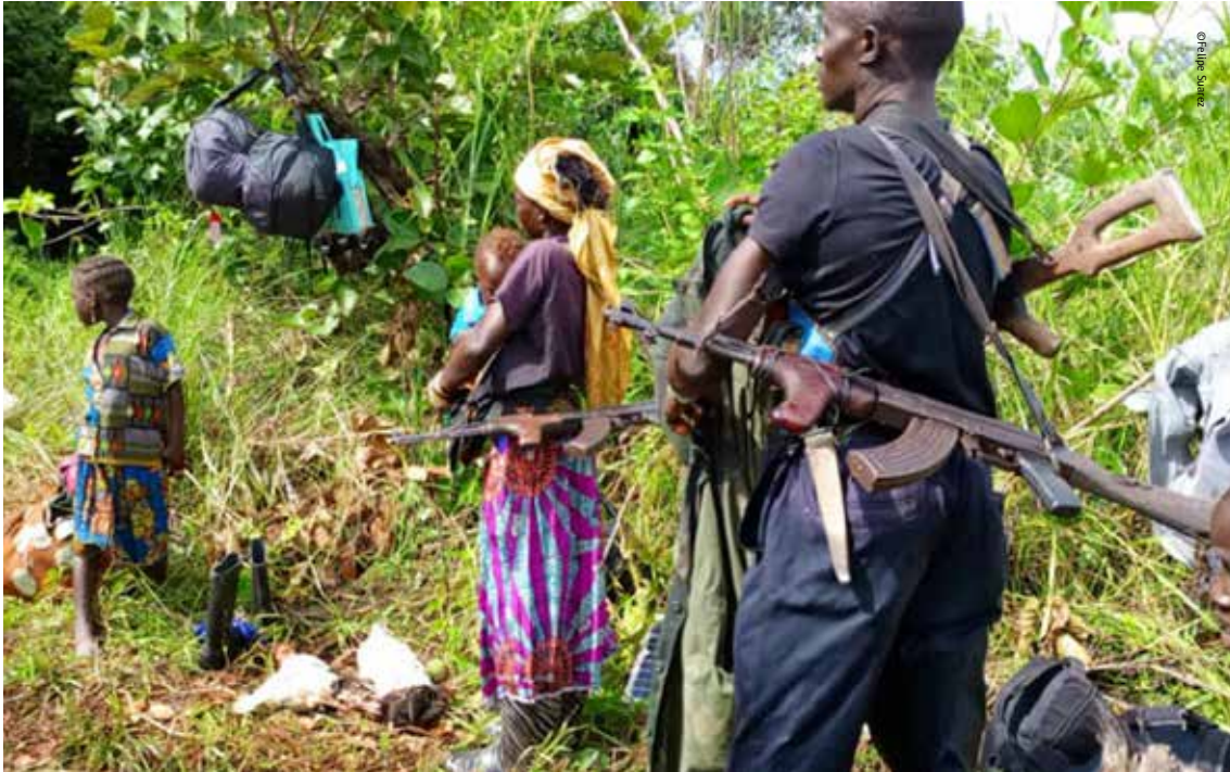
Lord's Resistance Army (LRA) rebels and kidnapped women on the way to disarmament. After repatriation, they participated in a reintegration program.