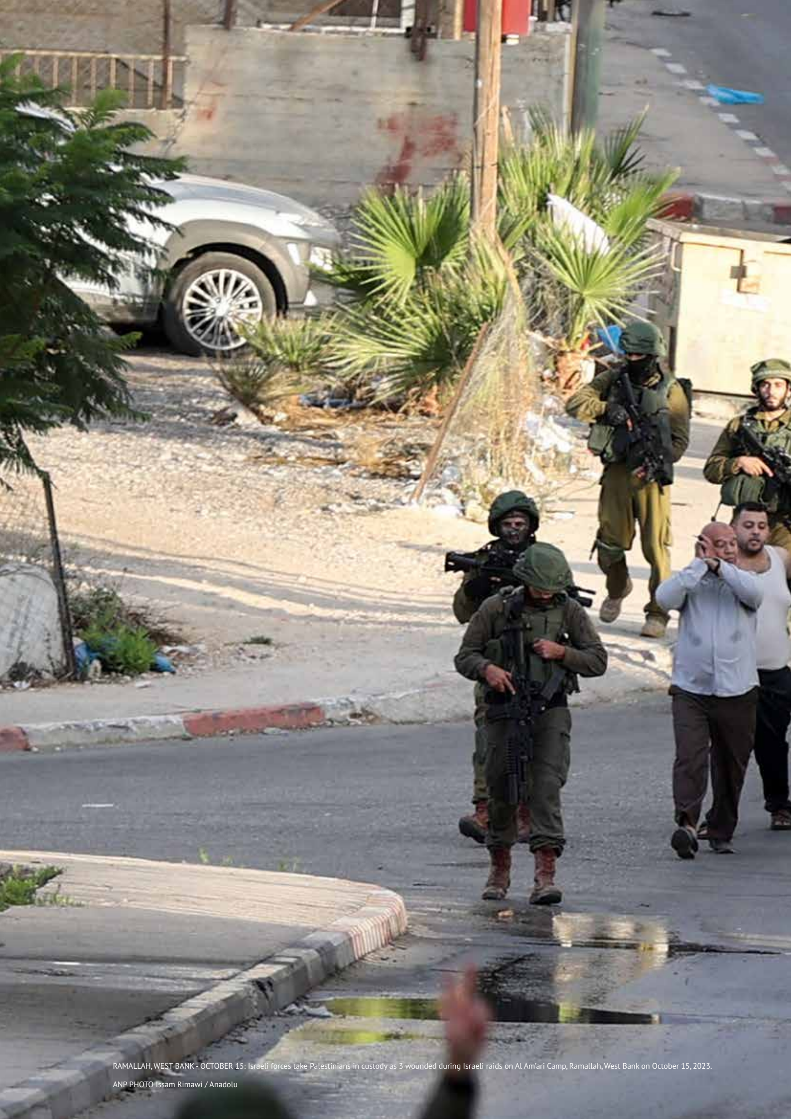
RAMALLAH, WEST BANK - OCTOBER 15: Israeli forces take Palestinians in custody as 3 wounded during Israeli raids on Al Am'ari Camp, Ramallah, West Bank on October 15, 2023.