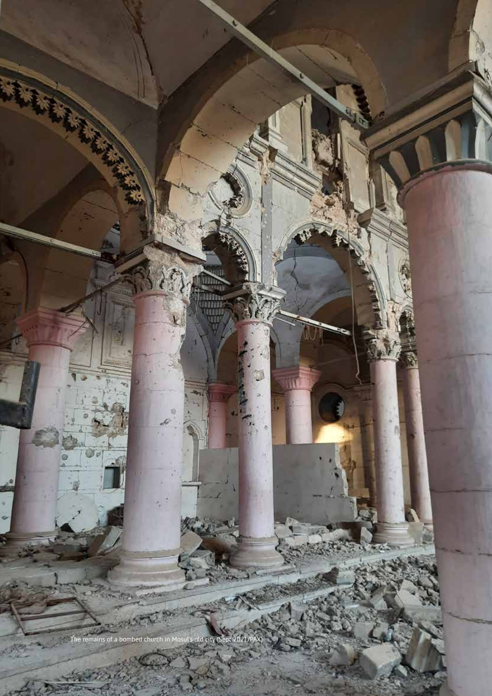
The remains of a bombed church in Mosul's old city (Sept 2021)