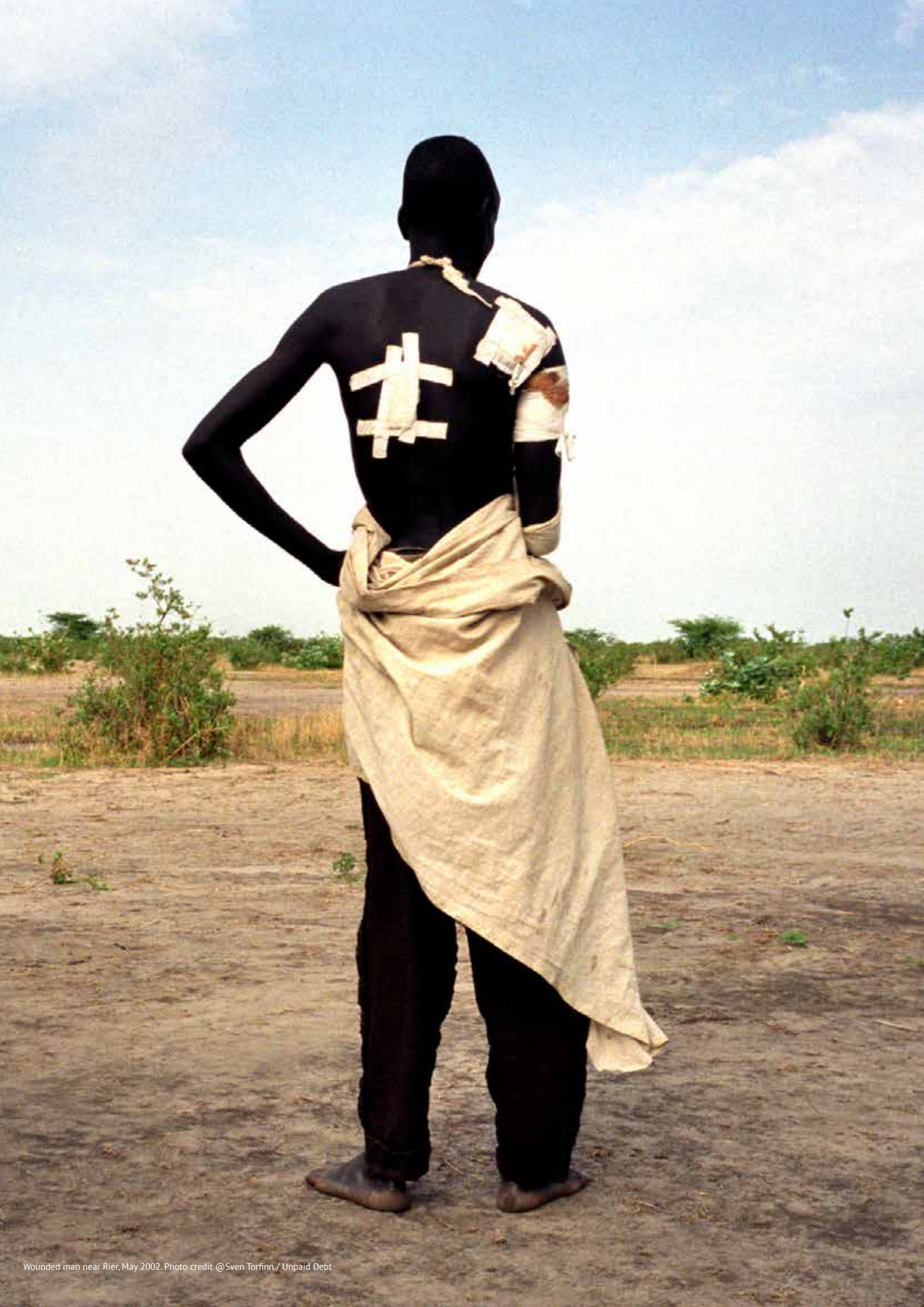
Wounded man near Rier, May 2002.