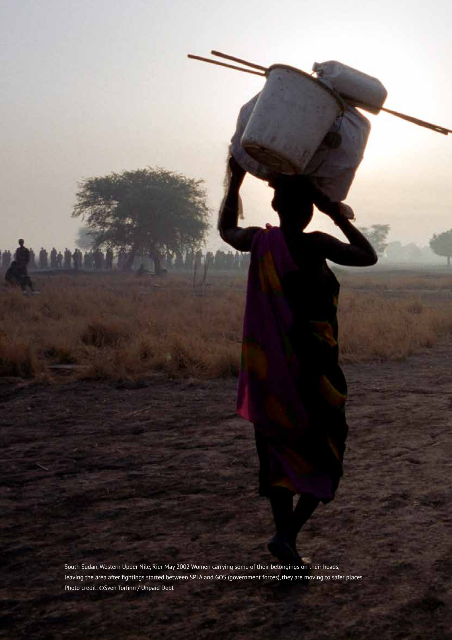
South Sudan, Western Upper Nile, Rier May 2002 Women carrying some of their belongings on their heads, leaving the area after fightings started between SPLA and GOS (government forces), they are moving to safer places