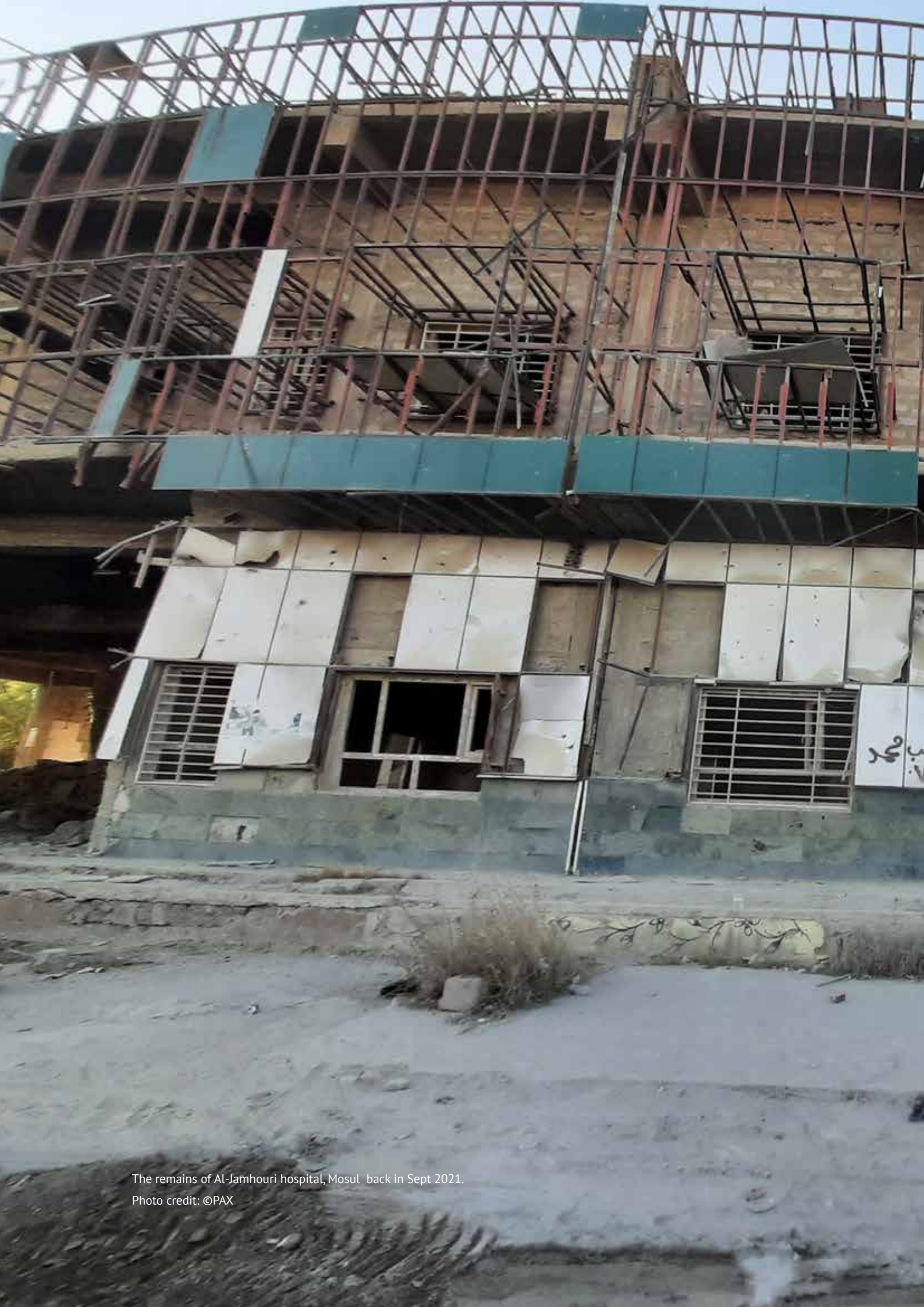
The remains of Al-Jamhuri hospital, Mosul back in Sept 2021.