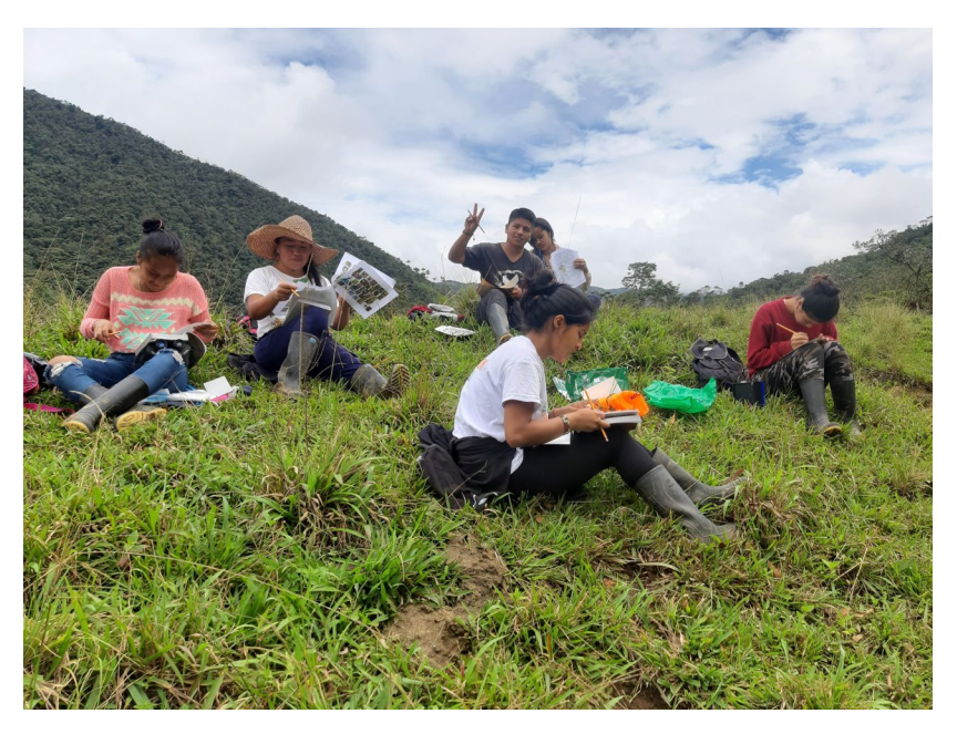
Figure 2. Youth engagement committed to peace and environment in Santa Rosa, Colombia.

The community of Santa Rosa was founded in 1870 and is located in the southwest of Colombia, in the south of the province of Cauca, 270 kilometres from its capital (Popayán). It has a strong indigenous presence but is also known for the arrival and transit of