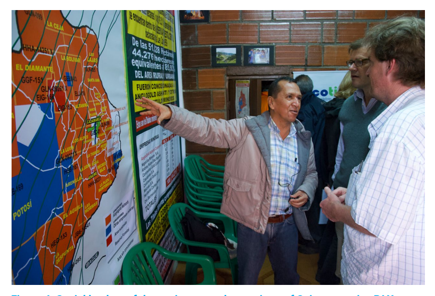
Figure 4. Social leaders of the environmental committee of Cajamarca give PAX delegation explanation.

Co-operate in a cross-border approach: Because of the crossborder dimension of the lives of pastoralists and of most environmental features in a landscape, PAX suggests a crossborder dimension to NbS initiatives in border regions. The crossborder nature of the programme is an exception in the world of peacebuilding and development, where both funding and project implementation strategies are generally limited to one country. As becomes clear in this programme, in areas where ethnic groups and/ or conflict dynamics span several nation-states - just like the grazing lands and water resources used by various communities - a singular focus on one country inhibits an adequate response to conflict and environmental degradation.