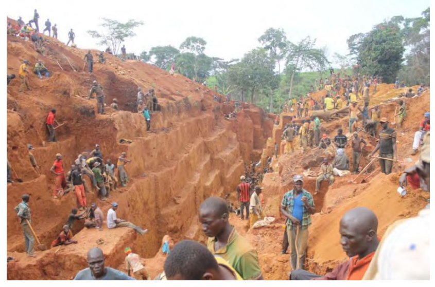
Figure 5. Artisanal mining in Eastern Province, DRC.

Various incidents were documented in relation to the nature reserve. In summary, in 2014 and 2015, there were attempts to forcibly evict artisanal miners from the natural reserve, leading to a series of violent incidents. At the same time, the DRC military protected semi-industrial gold mining by Chinese operators.