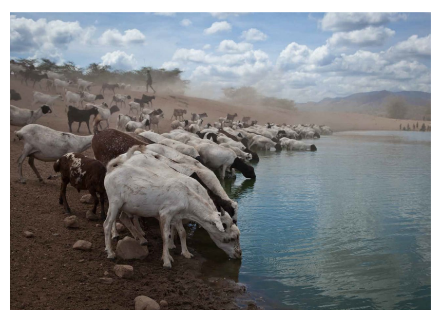
Figure 3. Pastoralism in the borderlands of Kenya, South Sudan and Uganda: Goats drinking at Lake Turkana.

and ammunition, and the commercialisation of cattle. This is exacerbated by local elites and politicians who use these communities as proxy forces to expand their territory in relation to the unclear border.