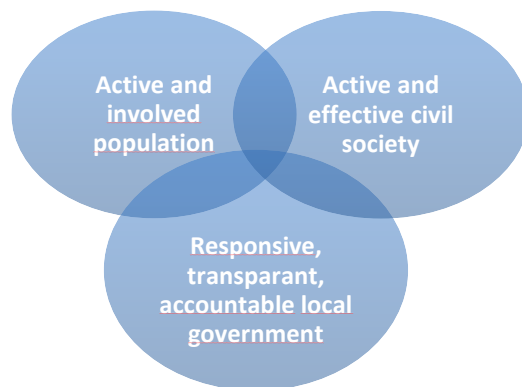
Figure: Aspects for change

The project will be implemented by VNG International, in close collaboration with PAX and local partner organisations (local CSOs and government associations).